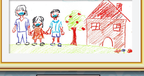
Paul Black Age: 10, Bridge of Don